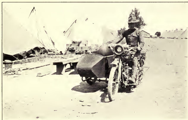
THE AUTHOR AND HIS "INDIAN"